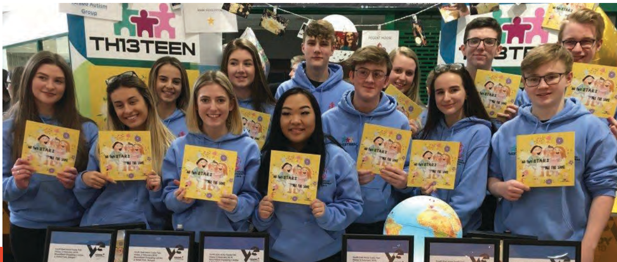
Young Enterprise Scheme