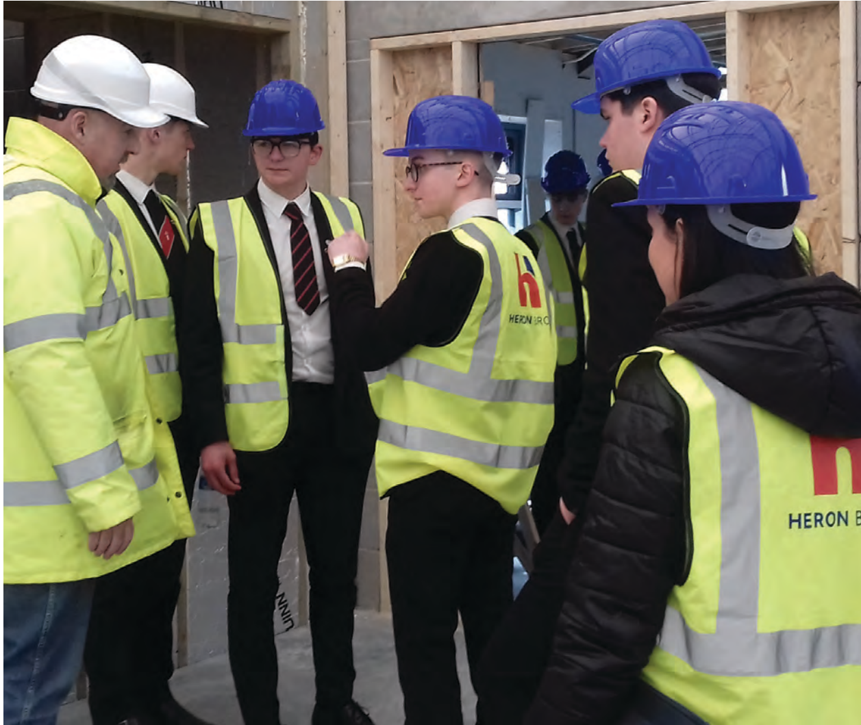
Careers trip to the new Ards and North Down Borough Council Leisure Centre site